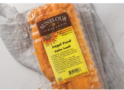
SUNFLOUR BAKERY ANGEL FOOD CAKE 8 oz. $5.50 EA. Save $1.50