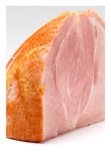
$11.99 LB. Save $3.00 lb.

Celebrity SHEEP CHEESE LOGS NEW flavor! These small batch sheep cheese logs are a great addition to your next board. Keep them handy to enjoy with crackers or your morning bagel. $5.49 LB.