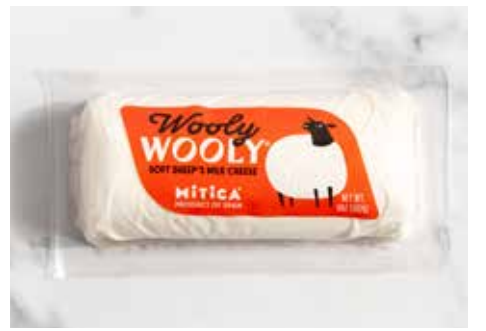
Mitica WOOLY WOOLY

Fresh, soft sheep's milk cheese made with milk from the Murcia region of Spain.