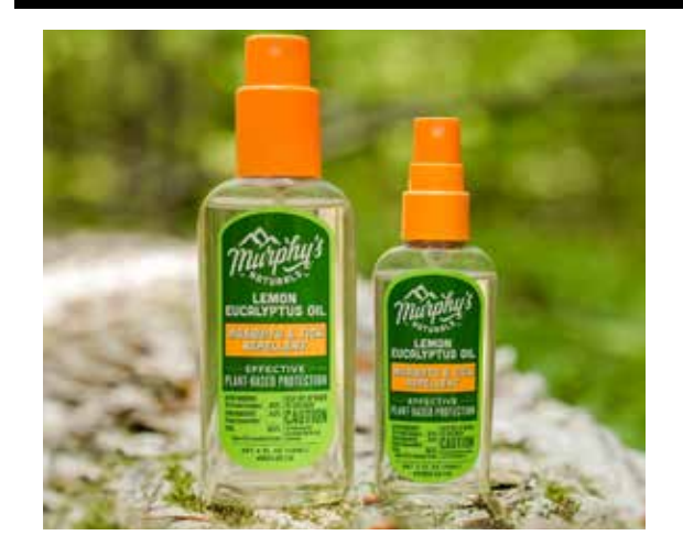
Murphy's Naturals NATURAL INSECT REPELLENT 20% OFF