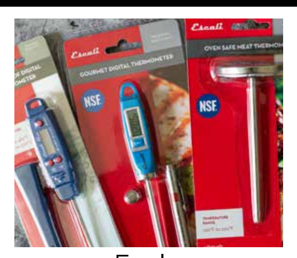
Escali THERMOMETERS AND SCALES 20% OFF