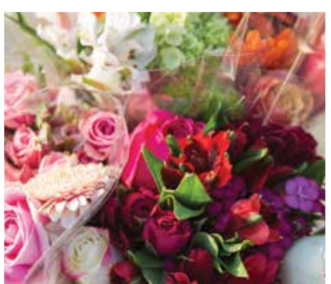
EMMA MIXED BOUQUET $12.49 EA. Save $0.50 ea.