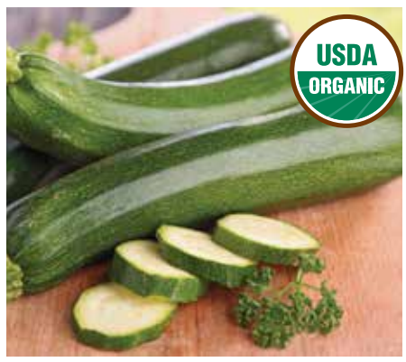
ORGANIC ZUCCHINI OR YELLOW SQUASH