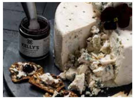
Kingston Creamery HERITAGE BLUE GOAT CHEESE

Rolled in dried fruit or infused with chipotle or bourbon, these goat cheese logs are a great addition to your charcuterie board. Their dessert-like Blueberry Vanilla is so creamy and sweet, you could eat it with a spoon! Maple Bourbon, Chipotle Honey, or Blueberry Vanilla.