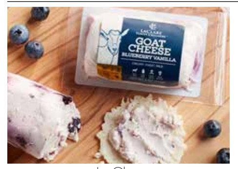
La Clare GOAT CHEESE LOGS

Rolled in dried fruit or infused with chipotle or bourbon, these goat cheese logs are a great addition to your charcuterie board. Their dessert-like Blueberry Vanilla is so creamy and sweet, you could eat it with a spoon! Maple Bourbon, Chipotle Honey, or Blueberry Vanilla.