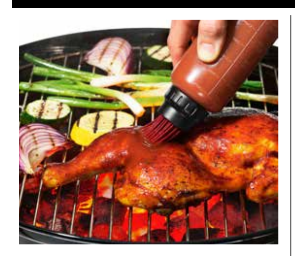
Oxo OXO GRILLING 20% OFF