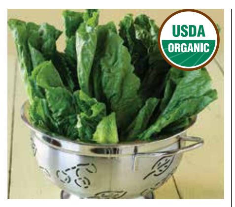
ORGANIC ROMAINE LETTUCE