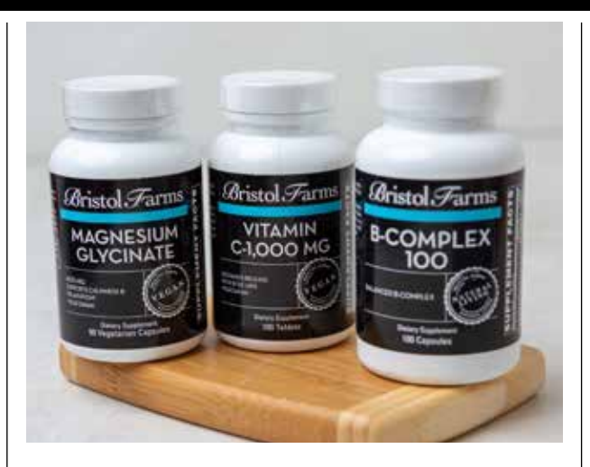
Bristol Farms ALL SUPPLEMENTS